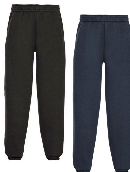
navy or black joggin bottoms