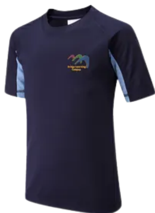
unisex PE top