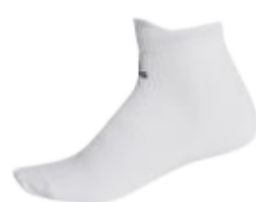
Socks - white, navy or black