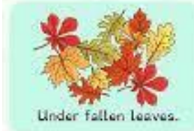
Under fallen leaves.