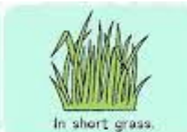
In short grass