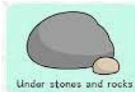
Under stones and rocks