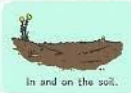
In and on the soil.

A microhabitat is a small area with unique conditions where different plants and animal live.