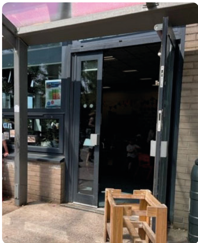
NURSERY CLASSROOM DOOR

Alternative adults picking up – If a different adult is picking your child up please inform the class teacher in the morning or message on Dojo.